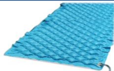
Model 4800 Pad

4400SCB Complete System, $129.95 4800 Pad only, $29.95