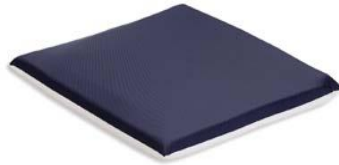
GEL-PRO LOW PROFILE