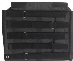
DRIVE 14300 ADJUSTABLE BACK CUSHION (INSTALLED ON CHAIR)

BACK CUSHION ADJ TENSION 16x17.5" ADJ 16-21" (E2611) DRIVE 14300, $149.95