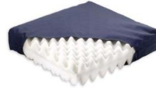
GEL-PRO DLX CONVOLUTED GEL