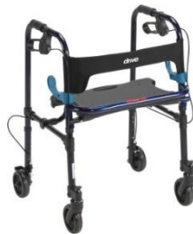
WALKER CLEVERLITE 5" CASTERS 300LB CAP ADJ SEAT HT: 20.5-24.5" 10230, $159.95