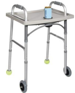
WALKER TRAY WITH CUP HOLDER 23"Wx1.5"Hx17"D 10124, $27.95