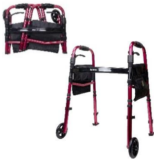
TRAVEL WALKER RED/BLACK ADJUST HEIGHT, 300LB CAP 10167, $79.95