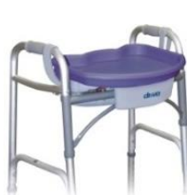
WALKER CADDY 15.5"Wx5"Hx12.5"D RTL10131, $29.95