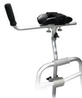
WALKER PLATFORM ATTACHMENT HT ADJ: 37-53" 6132B, $69.95