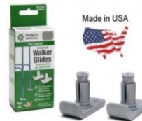
WALKER SKI GLIDES 3010, $19.95 -PR