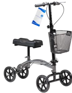
KNEE WALKER STEERABLE HAND BRAKES 300LB CAP 10216, $225.00