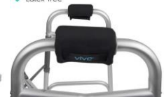
WALKER HAND GRIPS SUP1064, $16.95 -PR