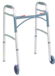
FOLDING WALKER WITH WHEELS, 350LB CAPACITY 10210-4 ADULT: ADJ HT 32-39" 10211-4 YOUTH: ADJ HT 25-32" $75.95