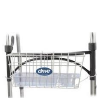
WALKER BASKET WITH INSERT 438B, $19.95