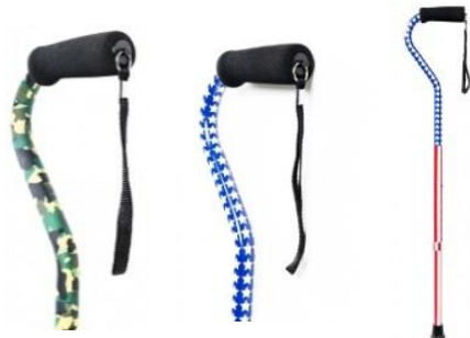
American Military & Pride Cane, $19.95