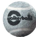
WALKER BALLS GRAY, RED, BLUE, PURPLE $8.99 -PR