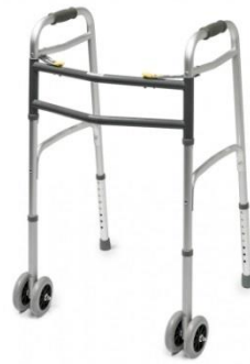
HD FOLDING WALKER WITH WHEELS 600LB CAPACITY 604070W, $125.00