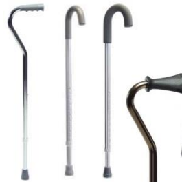
5940A 6220A 6221A 6327

(Height adjustable 30-39" 250 lb weight capacity)