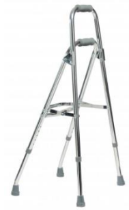
HEMI WALKER FOLDING ADJ HT 30-35" 300LB CAP 6015A, $59.95