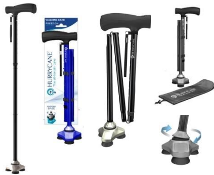
HURRYCANE FREEDOM EDITION FOLDING CANE, $49.95