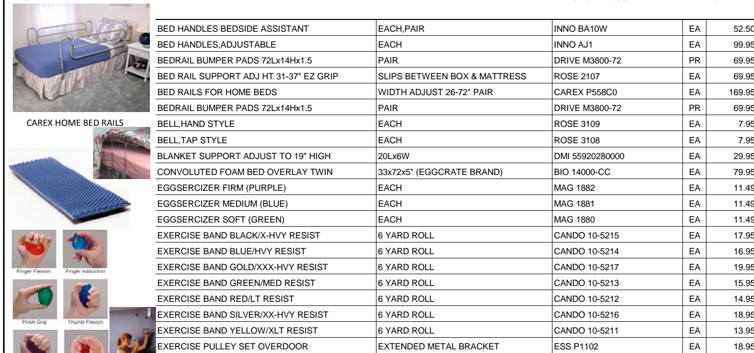
CAREX HOME BED RAILS