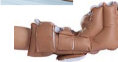
EHOB Heel Elevator Custom