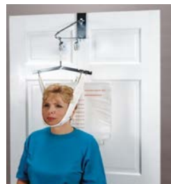
GF 1871 OVERDOOR TRACTION